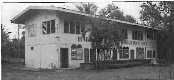
International Grace Bible Institute Davao

At present the mission is having a program of helping those Pastors who are doing pioneering work by giving them $60 a month. But due to very limited funds only few are being supported. Our united effort will greatly enhance the furtherance of the ministry.