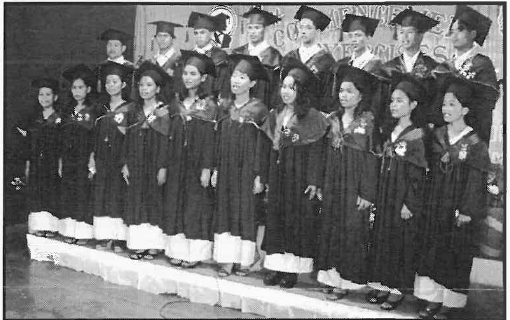
2002 Graduates - International Grace Bible Institute - Ozamiz

Training became a must if pastors, evangelists and teachers were to take on the care of the new churches and further outreaches.