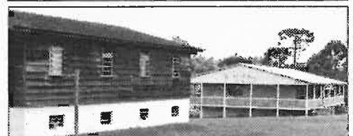
Teachers and Facilities in Southern Brazil