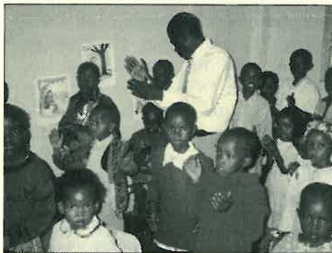
The result of the feeding program

To make a great home we need to start with children in their early age. To make a great school we must start with the children in the home with proper training. To make a great church we start at home with the parents nurturing the children in the ways of the